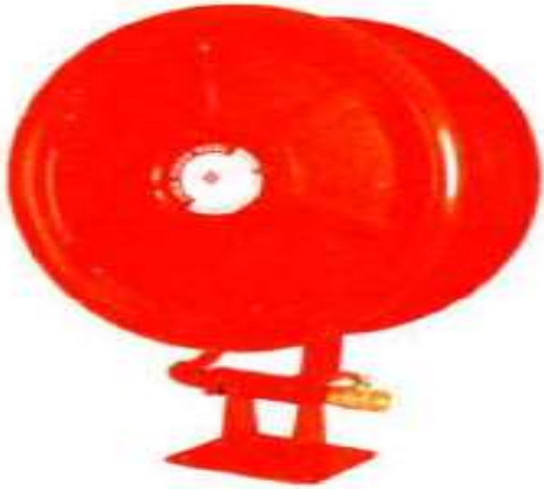
WALL MOUNTED TYPE FIXED / SWINGING TYPE IS:884