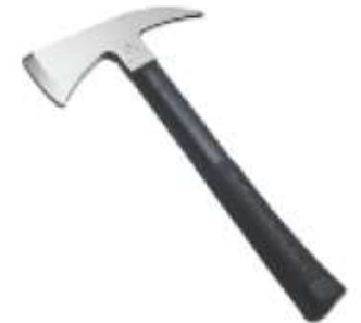
Fire Man Axe