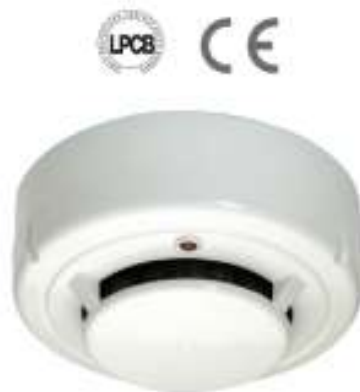
SMOKE & HEAT DETECTOR