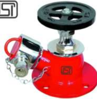
STAINLESS STEEL OBLIQUE IS 5290 TYPE "A"