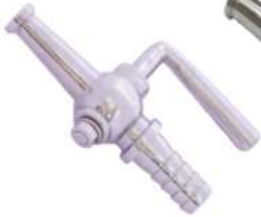
Gun Metal Cromium Plated