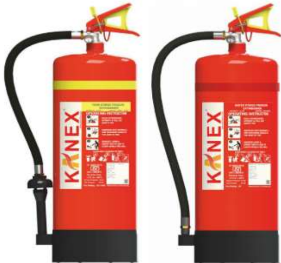
WATER & FOAM TYPE FIRE EXTINGUISHER