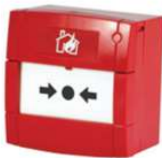
MANUAL CALL POINT