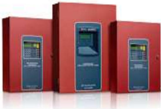
FIRE ALARM PANEL