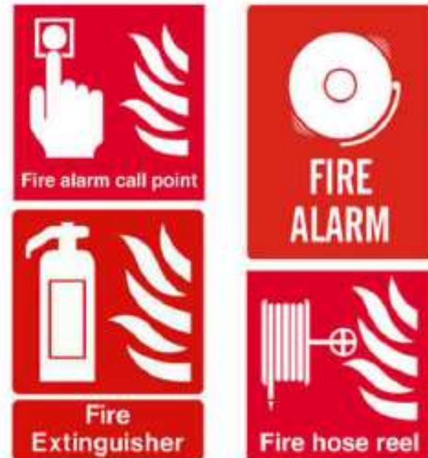
FIRE SAFETY SIGNAGES