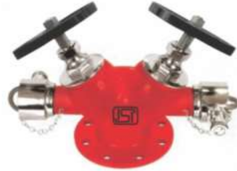
STAINLESS STEEL - IS 5290 TYPE "B"