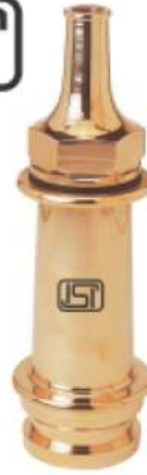
IS : 903 GUN METAL