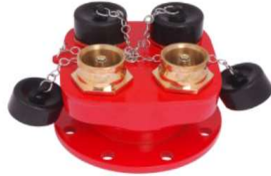
4 - Way