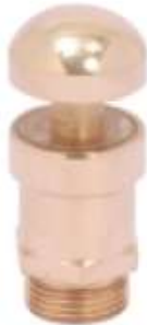
Air Release Valve