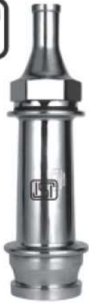
IS : 903 STAINLESS STEEL