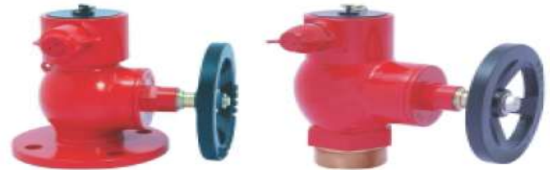
STRAIGHT THROUGH VALVE