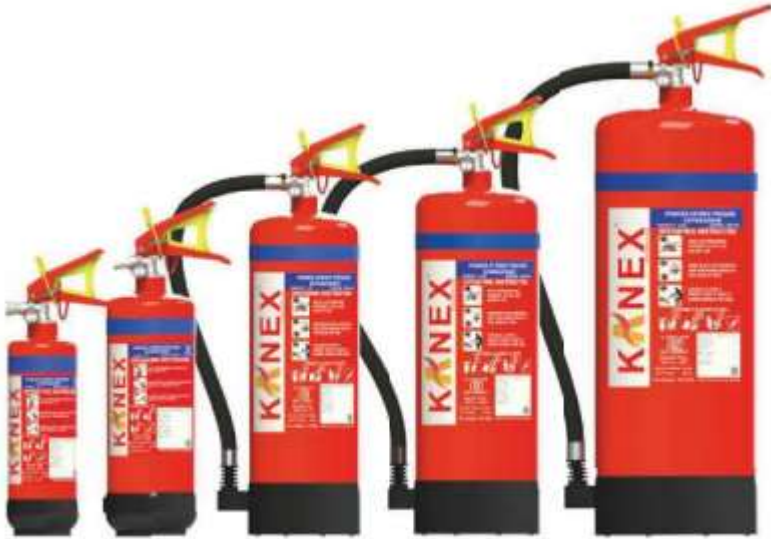
ABC TYPE FIRE EXTINGUISHER