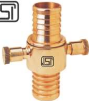
IS : 903 GUN METAL