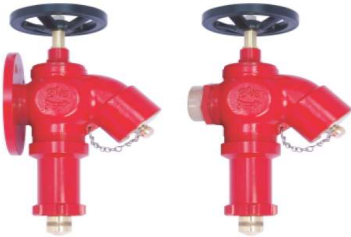
PRESSURE REGULATING VALVE "E" TYPE