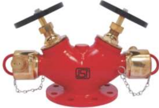
GUN METAL - IS 5290 TYPE "B"