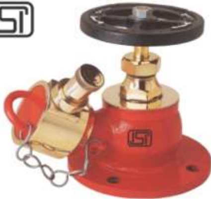
GUN METAL OBLIQUE IS 5290 TYPE "A"