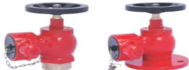
RIGHT ANGLE VALVE