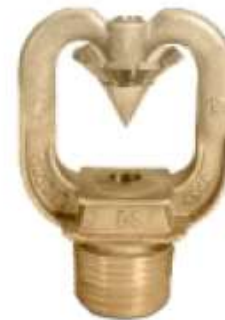
Medium Velocity Spray Nozzle