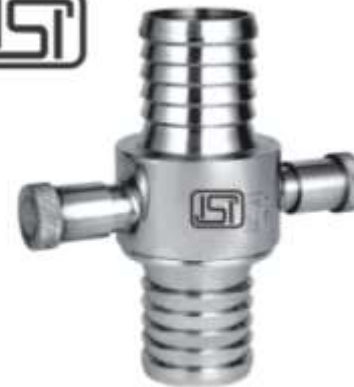
IS : 903 STAINLESS STEEL