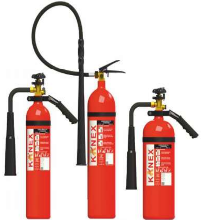
CO2 TYPE FIRE EXTINGUISHER